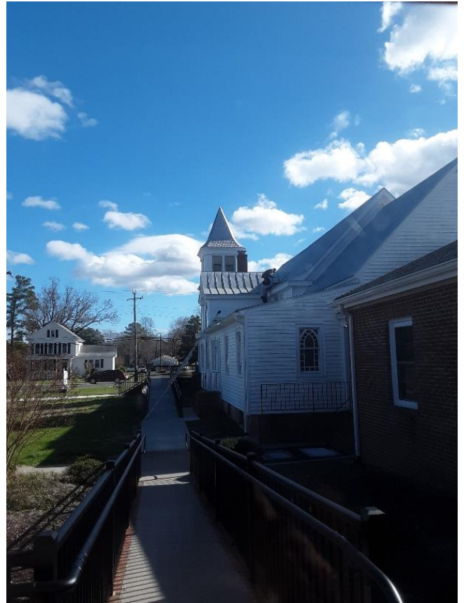
Crew fixing a leak in the roof