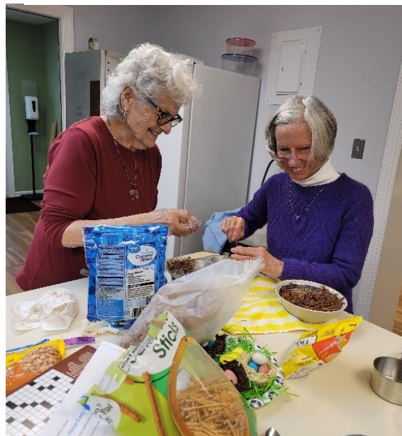
Fun at the JOY meeting