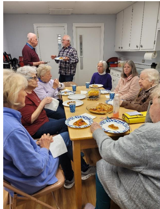
Making edible Easter nests (and a mess!) at our JOY meeting