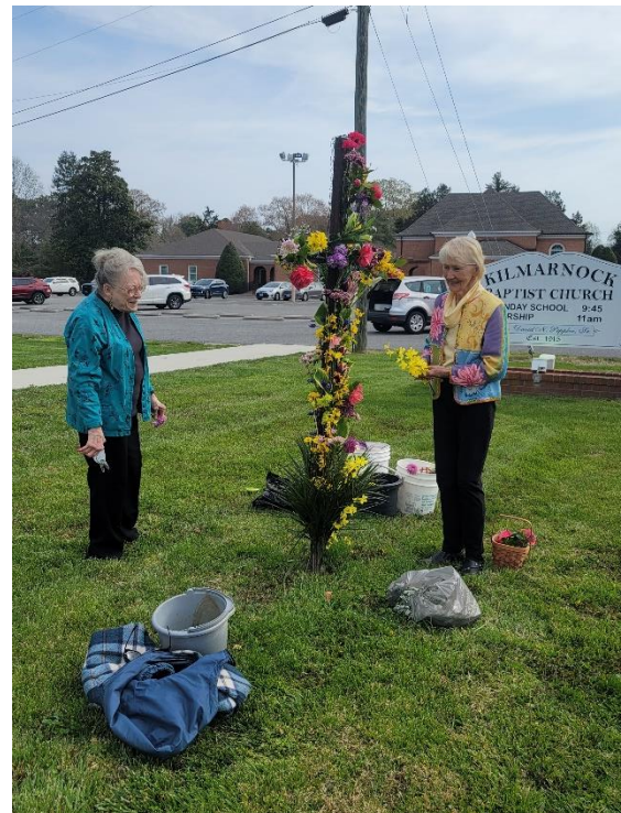
Flowering of the Cross