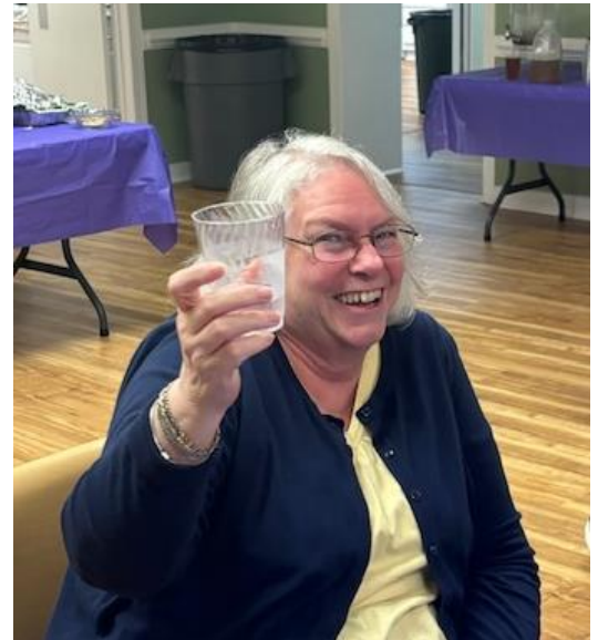
Maundy Thursday dinner