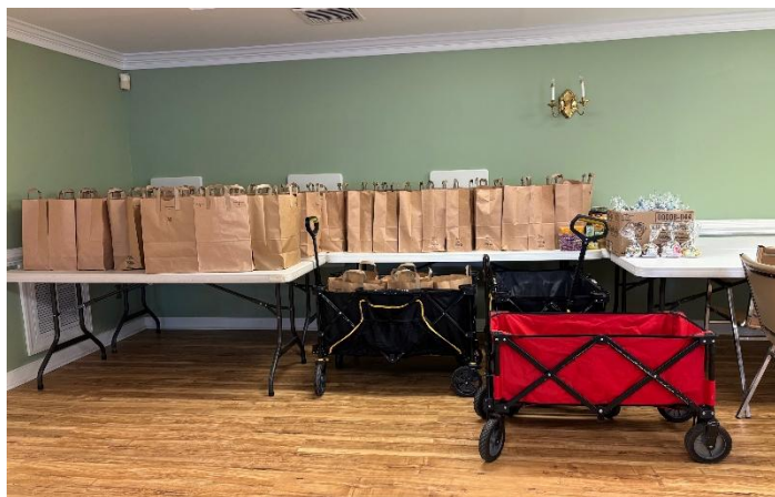
Bag of Thanksgiving items for each client. A turkey was placed in each car separately.

What better way to celebrate the Hope of Advent than by joining together to break bread, pray, laugh, and learn more about our Lord and Savior? Hope to see you on Sunday, December 21....or here's another idea...join us in