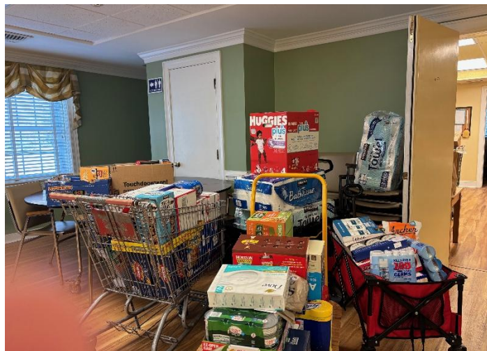
Donations from a lady who filled her SUV with a Costco trip