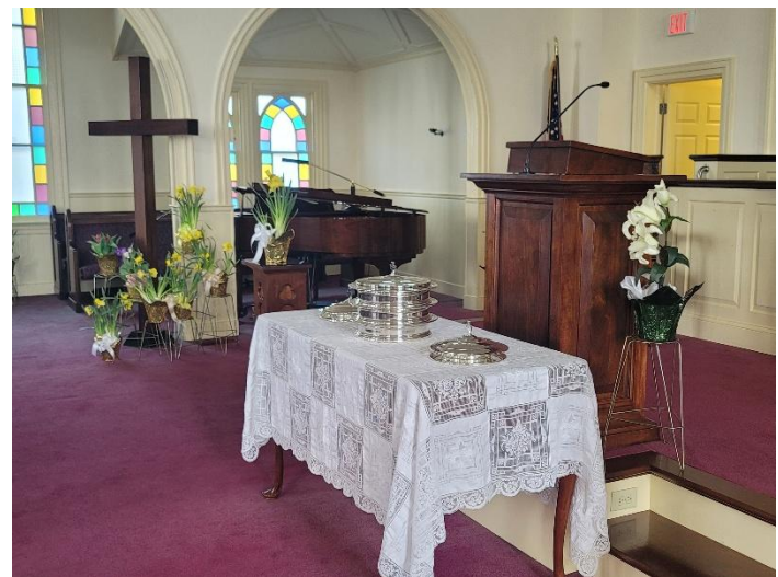
Beautiful lilies and daffodils fill the sanctuary on Easter morning