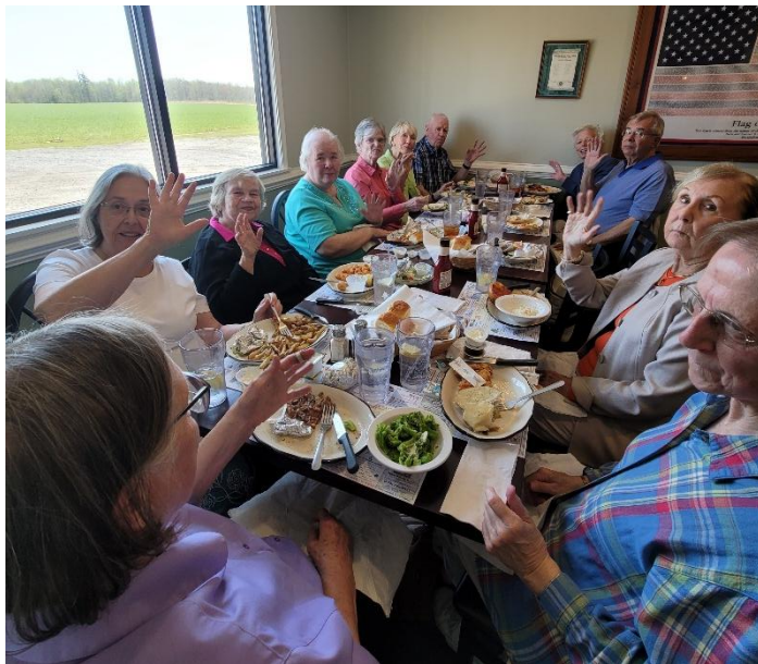
JOY Group enjoys a wonderful lunch at Nick's Restaurant